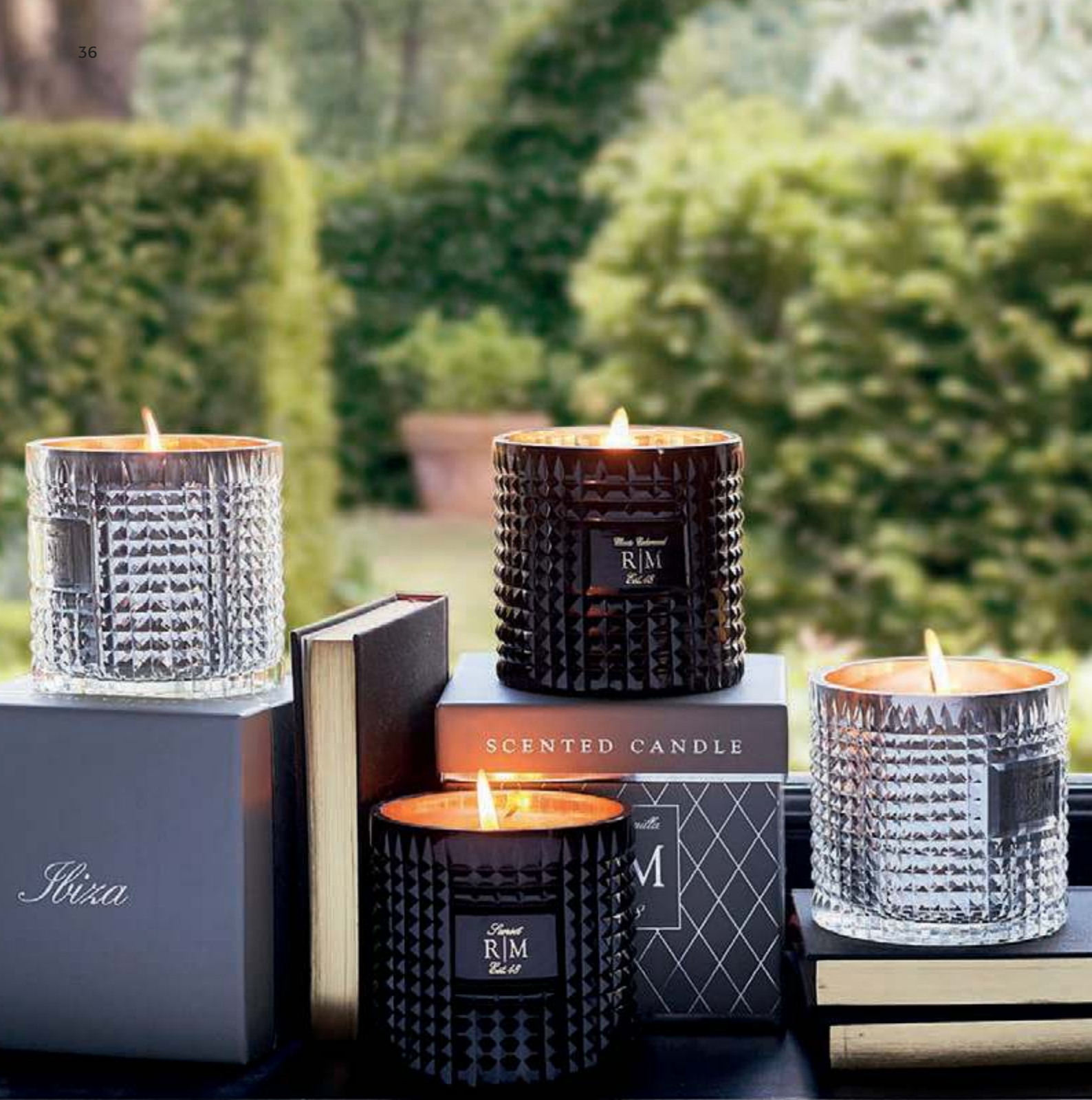
Luxury Scented Candle Sunset, Luxury Scented Candle Classic Cedarwood, Luxury Scented Candle Ibiza, Luxury Scented Candle Classic Vanilla.