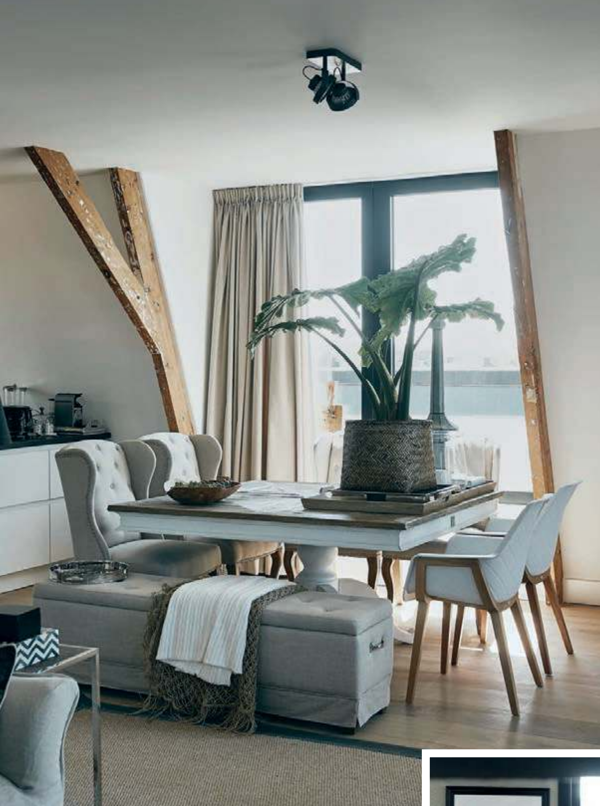
The Club Bench linen, flax, Keith II Dining Wing Chair linen, flax, Château Belvédère Dining Table, Amsterdam City Dining Armchair pure white.