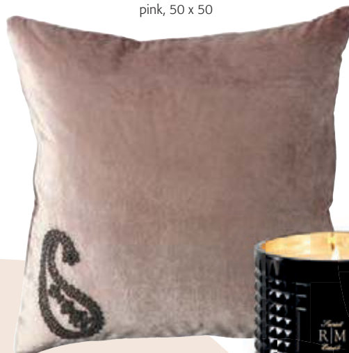
Precious Paisley Pillow Cover pink, 50 x 50

The ultimate colour to bring immediate warmth into your interior, and makes your home oh so opulent and chic: gold! This autumn gold is very prevalent in the collection, and we simply love it. Both the accessories and the furniture in this superb collection feature a touch of gold here and there!