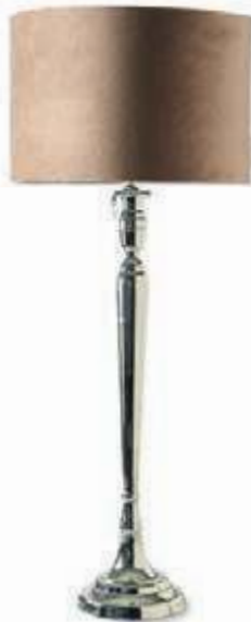
Lamp Rue De Rivoli, Velvet Cylinder Lampshade sand, 15 x 20 cm.