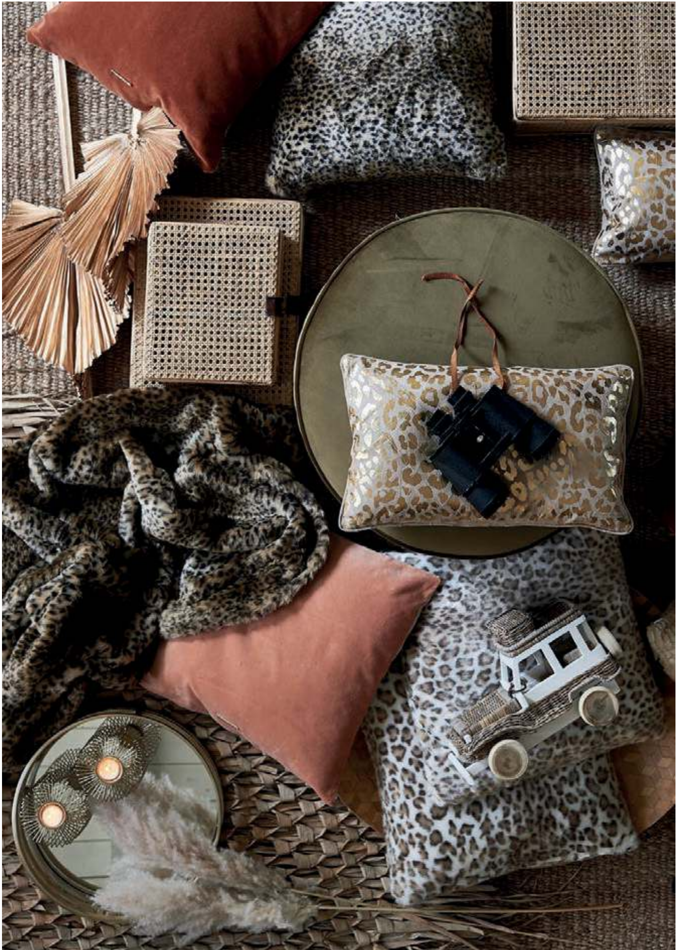
Vintage Velvet Pillow Cover pumpkin, 50 x 50 cm**, Leopard Faux Fur Pillow Cover 50 x 50 cm**, Canggu Storage Box small, medium and large, San Diego Pouf Round velvet, windsor green, Leopard Leather Pillow Cover gold, 50 x 30 cm**, Leopard Faux Fur Throw**, Vintage Velvet Pillow Cover orange, 50 x 50 cm**, Snow Leopard Faux Fur Pillow Cover 50 x 50 cm**, Rustic Rattan Desert Jeep, Bondstreet Mirror Tray*, RM Luxury Wire Votive. * Available from the end of September 2019. ** Available from mid-October 2019.