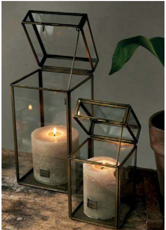
French Glass Display Box 20 x 20 cm, French Glass Love Box 30 x 18 cm, French Glass Etcetera Box 60 x 40 cm, Je Ne Sais Quoi French Glass Box 40 x 10.5 cm, French Glass Hurricane With Lid small and medium, Rustic Candle desert sand, 7 x 13 cm and 10 x 10 cm.