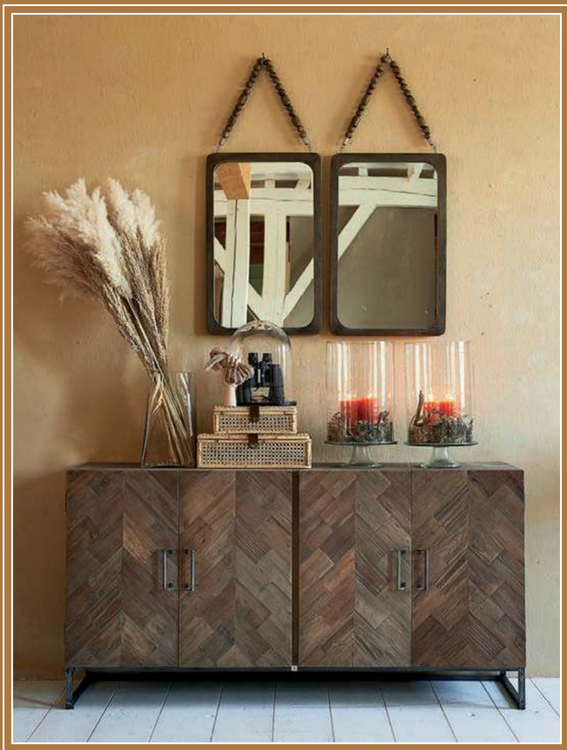
RM Beads Mirror 70 x 44 cm, Grocery Store Hurricane large, Canggu Storage Box small and medium, Napoleon Oval Dôme, Grimaldi Hurricane medium, Tribeca Dresser XL.

Leopard print is hot! Be it in the latest fashion or interior. And because we can't get enough of it, we've embraced this trend wholeheartedly. With a matching cushion collection in a rich coral hue that enhances the safari look & feel to great effect. Combine this with green-hued furniture, a touch of gold and numerous natural fabrics to attain the optimum 'safari chic' effect!