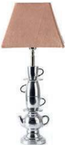
Have Tea With Me Table Lamp, Velvet Square Lampshade pink, 21 x 50 cm.