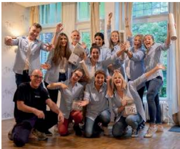
The RM team Het RM klusteam gave the Ronald McDonald House in Leiden house a magnificent makeover.

Besides the Ronald McDonald House in Leiden, another amazing Ronald McDonald House Charities project will complete this autumn. The first House in Belgium, in Brussels to be exact, will open its doors in October, and here too Rivièra Maison will contribute in part to its interior design. The Brussels House will officially open on 3 October; we will keep you up to speed via the usual means.