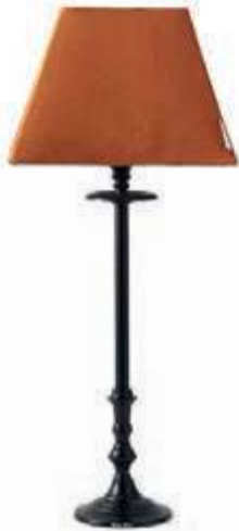
L'Hotel Lamp Base antique black, Velvet Square Lampshade pumpkin, 15 x 20 cm.