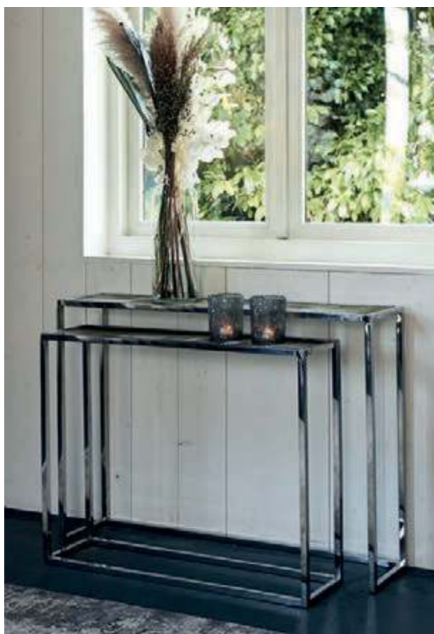
Washington Street Floor Lamp, Riviéra Maison Signature Serving Tray, The White Wine Glass*, Cameron Coffee Table set of 2, Bristol Wine Cooler, Lisbon Table Decoration, Rustic Candle black, 7 x 13 cm, Magic Mosaic Votive medium, The Red Wine Glass*, Bleeckerstreet Side Table set of 2. * Available from the end of September 2019.