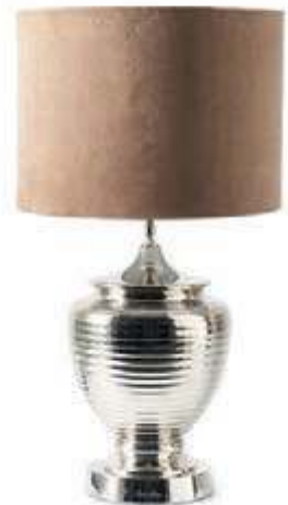
Rosewood Table Lamp, Velvet Cylinder Lampshade sand, 20 x 30 cm.