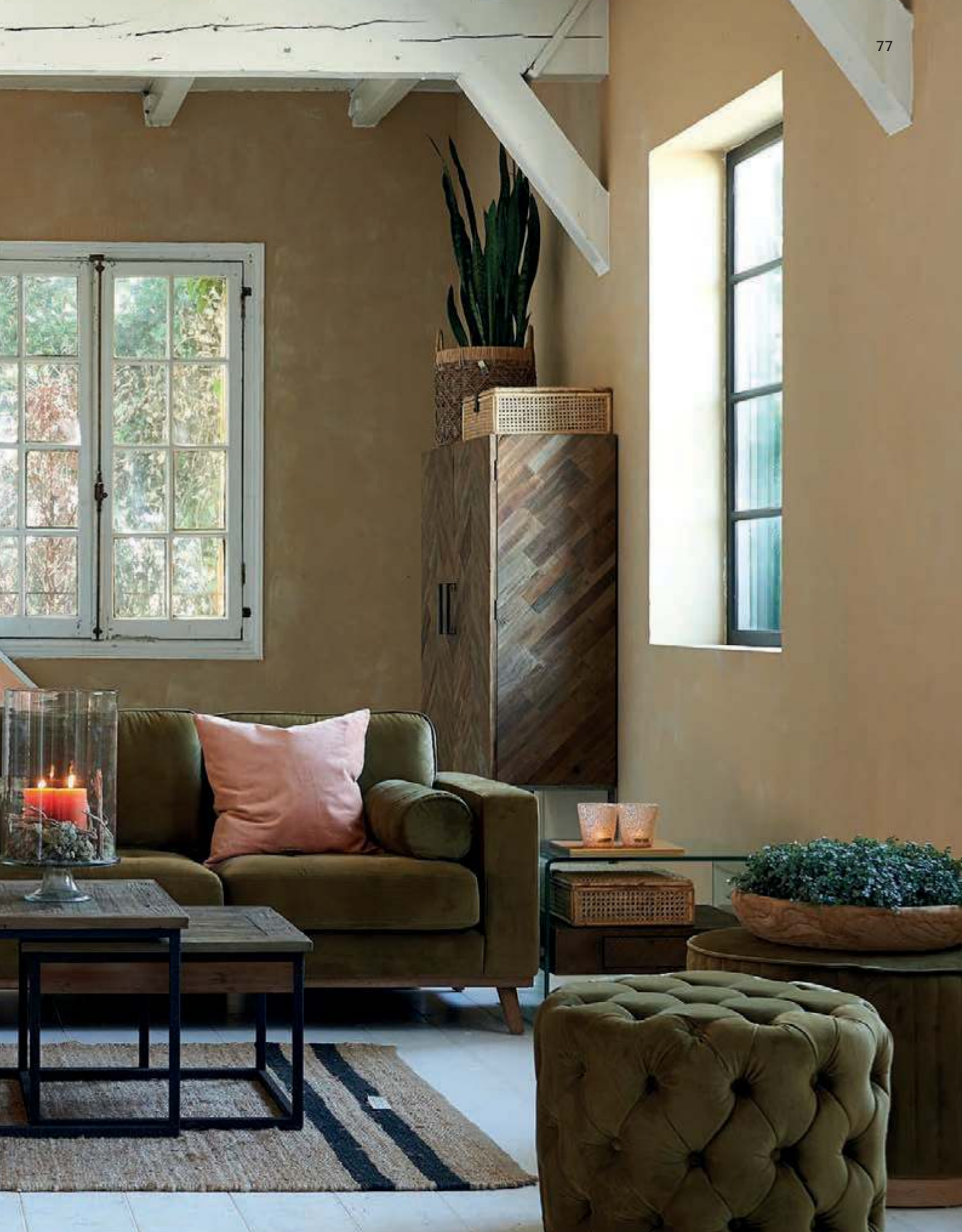
Canbrera Island Carpet 240 x 140 cm, Tribeca Bar Cabinet, Gold Dust Sprinkle Votive medium, San Diego Pouf round, windsor green, Opera Footstool velvet, windsor green. * Available from the end of September 2019. ** Available from mid-October 2019.