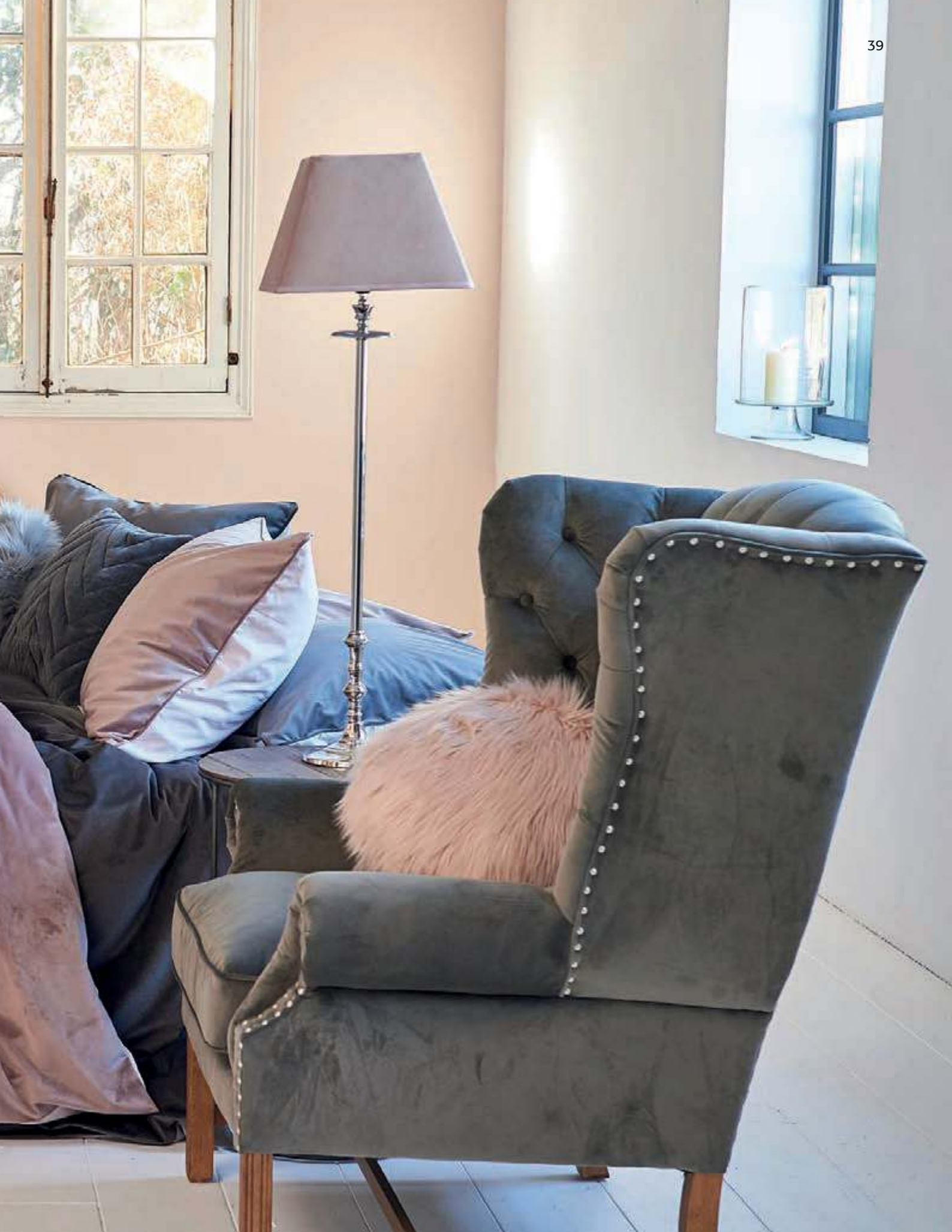
Classic 1960 Telephone), Lampbase L'Hotel large, Velvet Square Lampshade light pink, 21 x 30 cm, Franklin Park Wing Chair velvet, slate grey, RM Rounded Cushion pink, 40 x 40 cm.