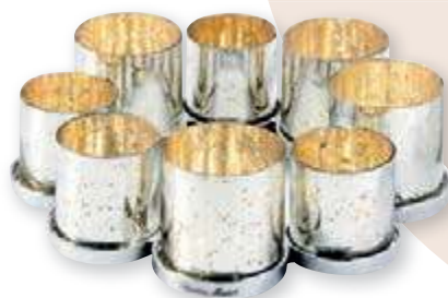
Long Acres Wreath

Here's an insight into what RM Loves this autumn. Each season we carefully select a few of our absolute favourites, just for you. Our showpieces, as it were.