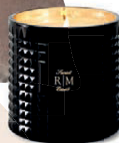
Luxury Scented Candle Sunset