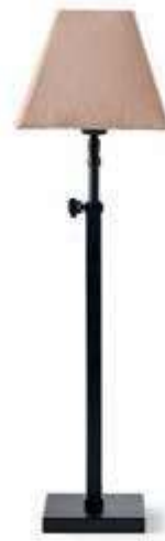
Soho House Table Lamp, Velvet Square Lampshade pink, 15 x 20 cm.