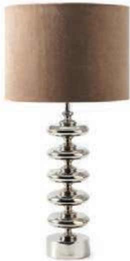
Pebble Lamp Base, Velvet Cylinder Lampshade sand, 20 x 30 cm.