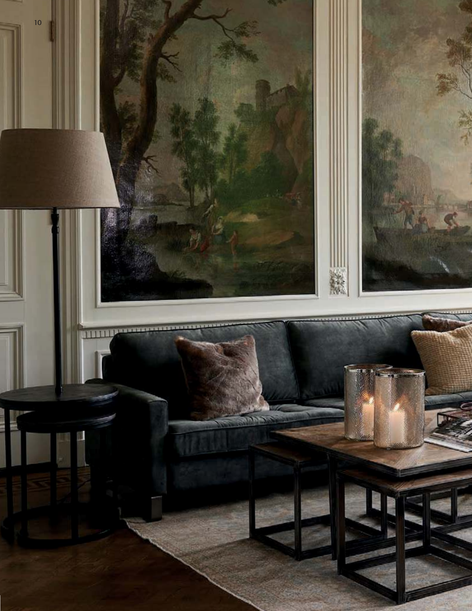
Bedford Avenue Side Table Lamp set of 2, Loveable Linen Lampshade natural, 35 x 45 cm, West Houston Corner Sofa Chaise Longue Right velvet, grimaldi grey, Le Bar Americain Coffee Table set of 5, Fancy Herringbone Hurricane large, Satin Sable Faux Fur Pillow Cover 50 x 50 cm*, Fabulous Fuzzy Faux Fur Pillow