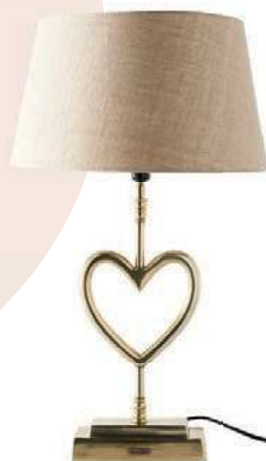
With Love Table Lamp soft gold & Loveable Linen Lampshade natural, 28 x 38 cm