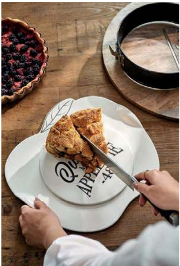
Fire Brigade Wine Cooler small, Enjoy Relax and Refresh Bottle large, The Kitchen Stories Bowl medium, George Dining Chair pellini, espresso, Amsterdam City Dining Chair linen, fabulous flax, Cape Breton Dining Chair pellini, camel, Arlington Dining Table extendable, 230 x 90 cm, Sparkle Celebrate Champagne Glasses set of 2, Concorde Champagne Cooler, Quality Made Apple Pie Springform, Enjoy Chopping Board Round.