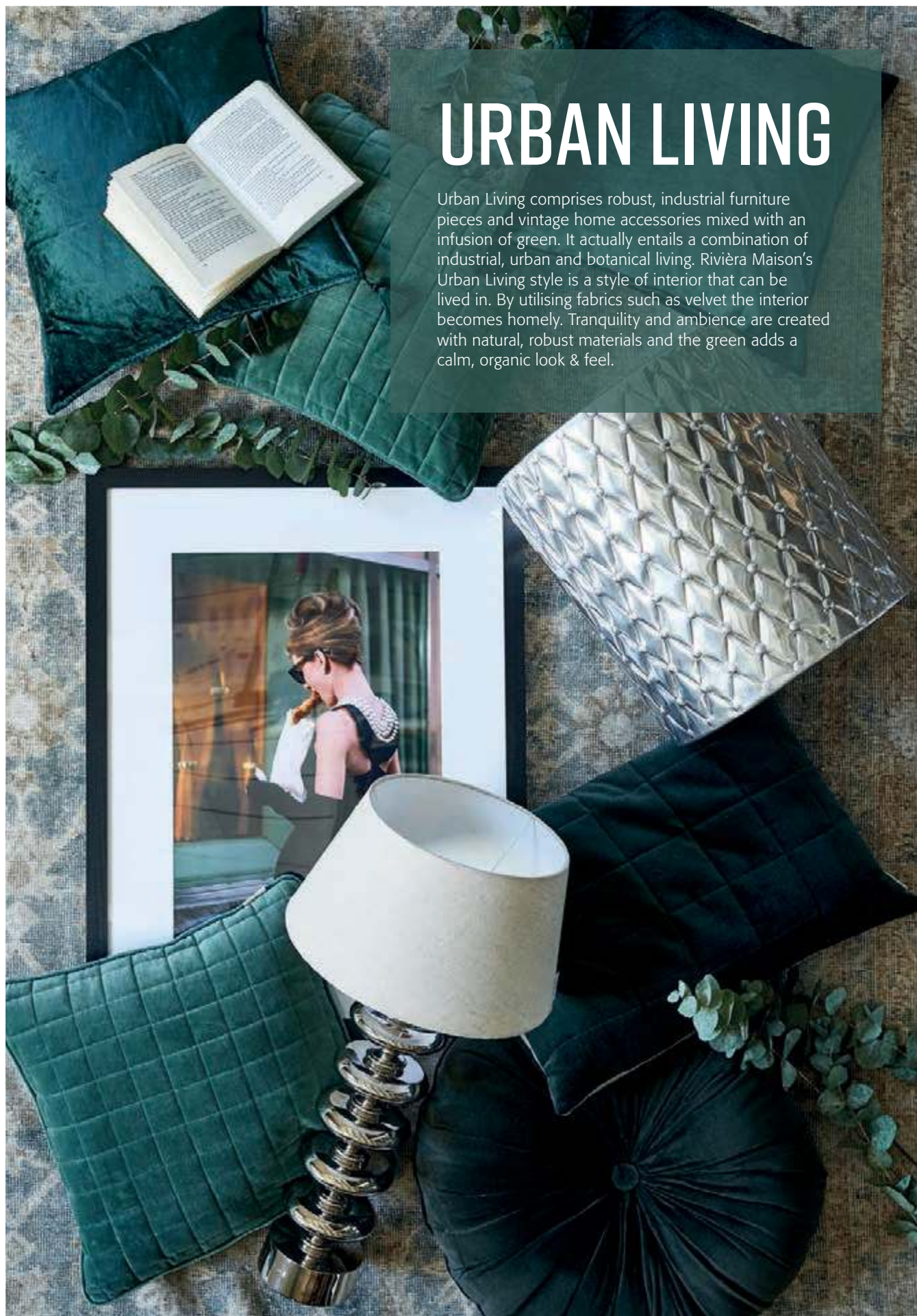
Tassel Treasure Pillow Cover green, 50 x 50 cm, Basic Block Small Quilted Pillow Cover green, 50 x 50 cm, Palace Of Monaco Pouf Ø40 cm, Wall Art Shopping 60 x 80 cm, Pebble Lamp Base, Loveable Linen Lampshade natural, 28 x 38 cm, Basic Block Quilted Pillow Cover forest green, 65 x 45 cm, Velvet Round Pillow forest green, Ø60 cm.

Urban Living comprises robust, industrial furniture pieces and vintage home accessories mixed with an infusion of green. It actually entails a combination of industrial, urban and botanical living. Riviera Maison's Urban Living style is a style of interior that can be lived in. By utilising fabrics such as velvet the interior becomes homely. Tranquility and ambience are created with natural, robust materials and the green adds a calm, organic look & feel.