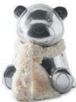
Bear Money Saver