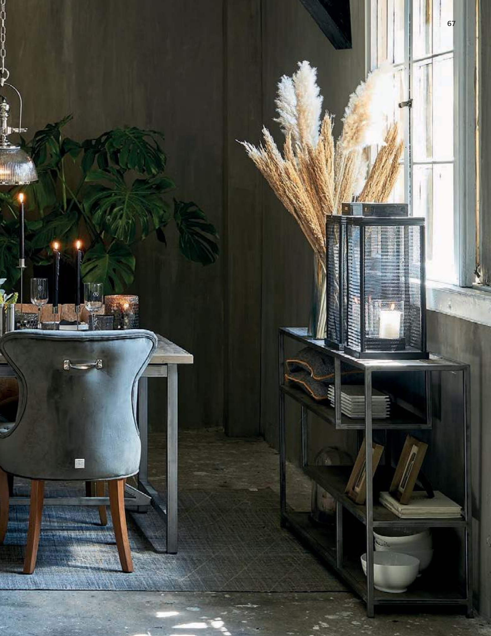
R-Red Wine Glass, Graphic Print Carpet grey, 240 x 140 cm, Midtown Side Table, Bahia Lantern Square medium.

* Available from the end of September 2019.