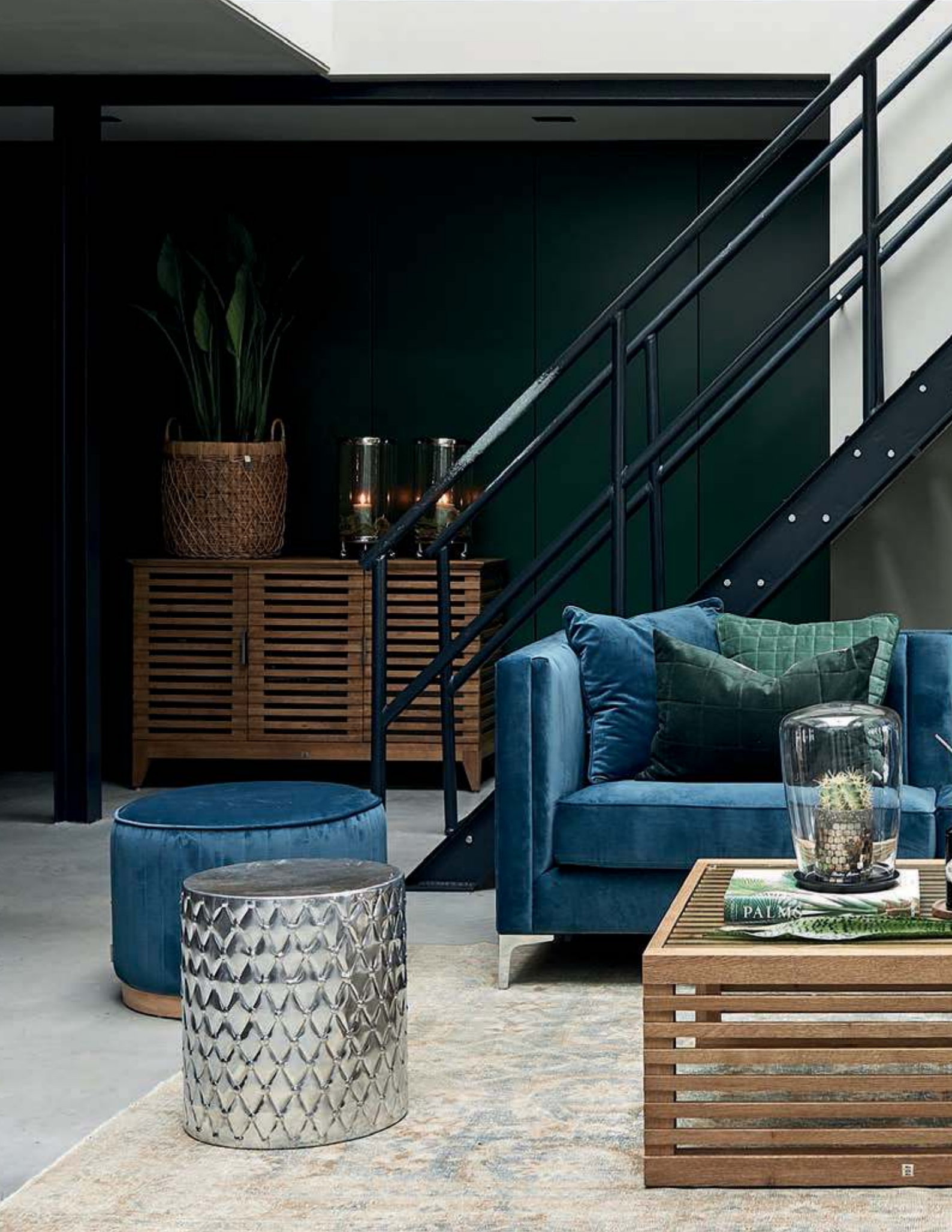
San Diego Pouf Round velvet, ocean blue, Ø60 cm, Palace Of Monaco Pouf Ø40 cm, Divers Cove Dresser, Rustic Rattan Diamond Weave Basket medium, Divers Cove Coffee Table, Paris Dôme, Finest Selection Gin & Tonic Glass, Christopher Sofa 3.5 Seater velvet, ocean blue, Basic Block Small Quilted Pillow