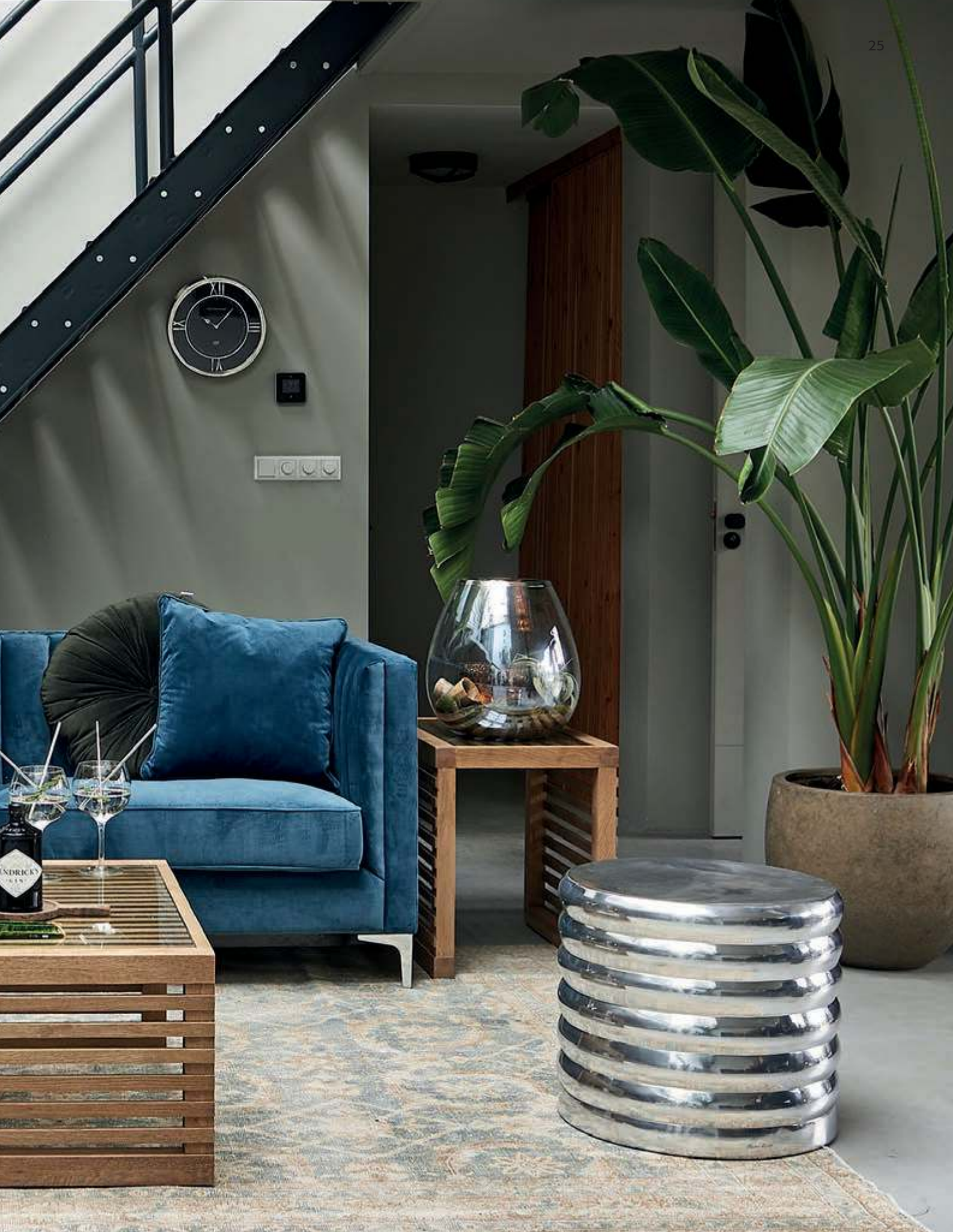
Cover green, 50 x 50 cm, Basic Block Quilted Pillow Cover forest green, 65 x 45 cm, Velvet Round Pillow forest green, Ø60 cm, Contemporary Wall Clock, Basic Bubble Hurricane large**, Divers Cove End Table, Times Square Round Pouf silver, Ø50 cm. ** Available from mid-October 2019.