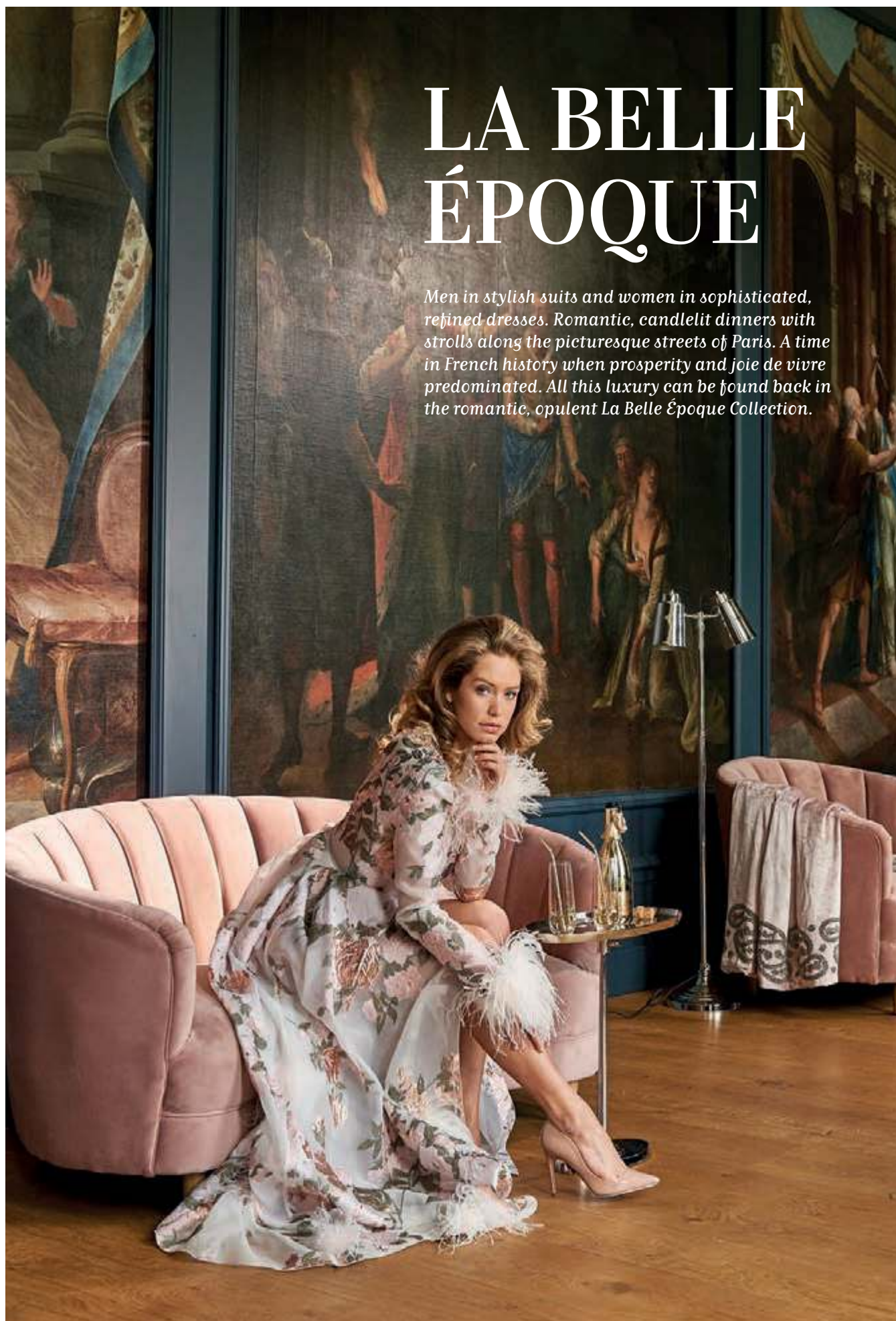
Beverly Hills Sofa 2.5 Seater velvet, blush, Kimberley End Table, Sparkle Celebrate Champagne Glasses set of 2, Murry Hill Floorlamp, Beverly Hills Love Seat velvet, blush Precious Paisley Velvet Throw soft pink.

Men in stylish suits and women in sophisticated, refined dresses. Romantic, candlelit dinners with strolls along the picturesque streets of Paris. A time in French history when prosperity and joie de vivre predominated. All this luxury can be found back in the romantic, opulent La Belle Époque Collection.