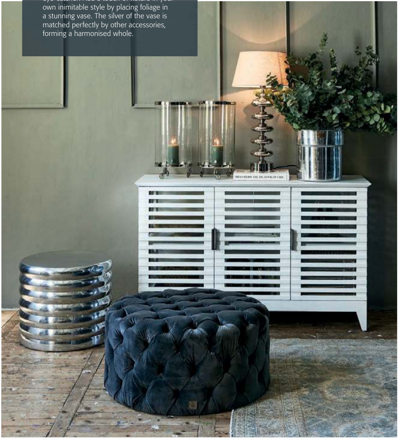
Times Square Round Pouf silver, Opera Hocker velvet, ocean blue, Divers Cove Dresser white, The District Hurricane, Rustic Candle olive green, 10 x 13 cm, Pebble Lamp Base, Loveable Linen Lampshade natural, 35 x 45 cm, City Loft Flower Pot large.

Make a statement in your interior with a magnificent cabinet. Cabinets are great storage pieces, but also inject ambience into your interior. Take this fabulous dresser made of recycled wood. A classic cabinet with a contemporary twist. A genuine eye-catcher! Add a touch of nature in your own inimitable style by placing foliage in a stunning vase. The silver of the vase is matched perfectly by other accessories, forming a harmonised whole.