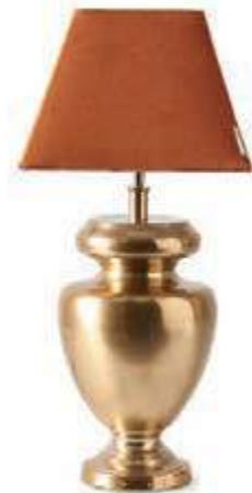
Madeline Table Lamp small, Velvet Square Lampshade pumpkin, 15 x 20 cm.