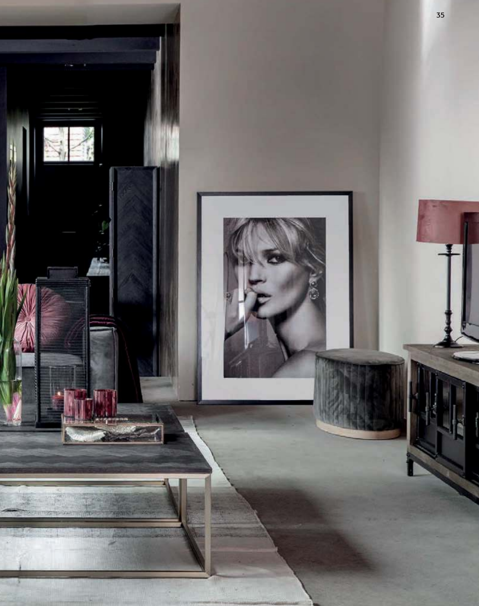
RM Floral Vase, Bahia Lantern Square large, Burgundy Bliss Votive small and medium, Wall Art Kate Moss Side 100 x 140 cm, San Diego Pouf Oval velvet, slate grey, L'Hotel Lamp Base antique black, Velvet Cylinder Lampshade dusty pink, 20 x 30 cm, The Hoxton Flatscreen Dresser.