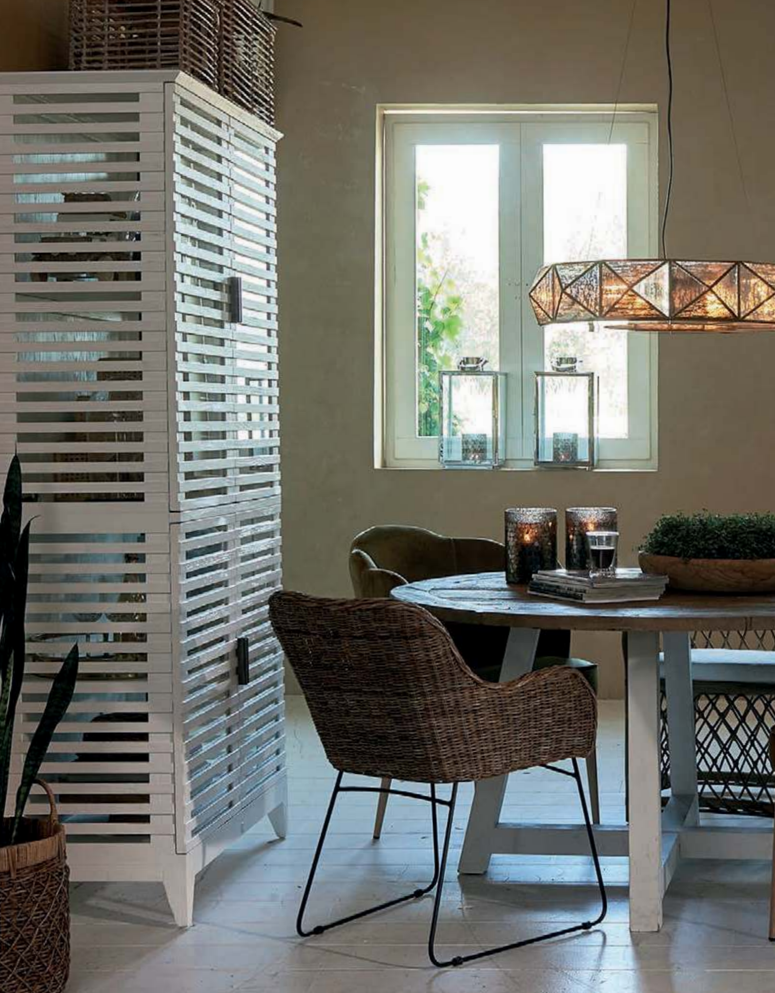
Rustic Rattan Diamond Weave Basket medium, Divers Cove Cabinet white, RM Suitcase Basket small* and large*, Canyamel Dining Table white base, Ø140 cm, Copenhagen Hanging Lamp large, La Marina Dining Armchair, Lauderdale Dining Chair velvet, windsor green and slate grey, Dune Deck Cafe Dining Armchair, Washington Street Floor Lamp, Fabulous Round Lampshade flax, 40 x 50 cm, Foxberry Inn Lantern medium, Notting Hill Sofa 2 Seater velvet, windsor green,