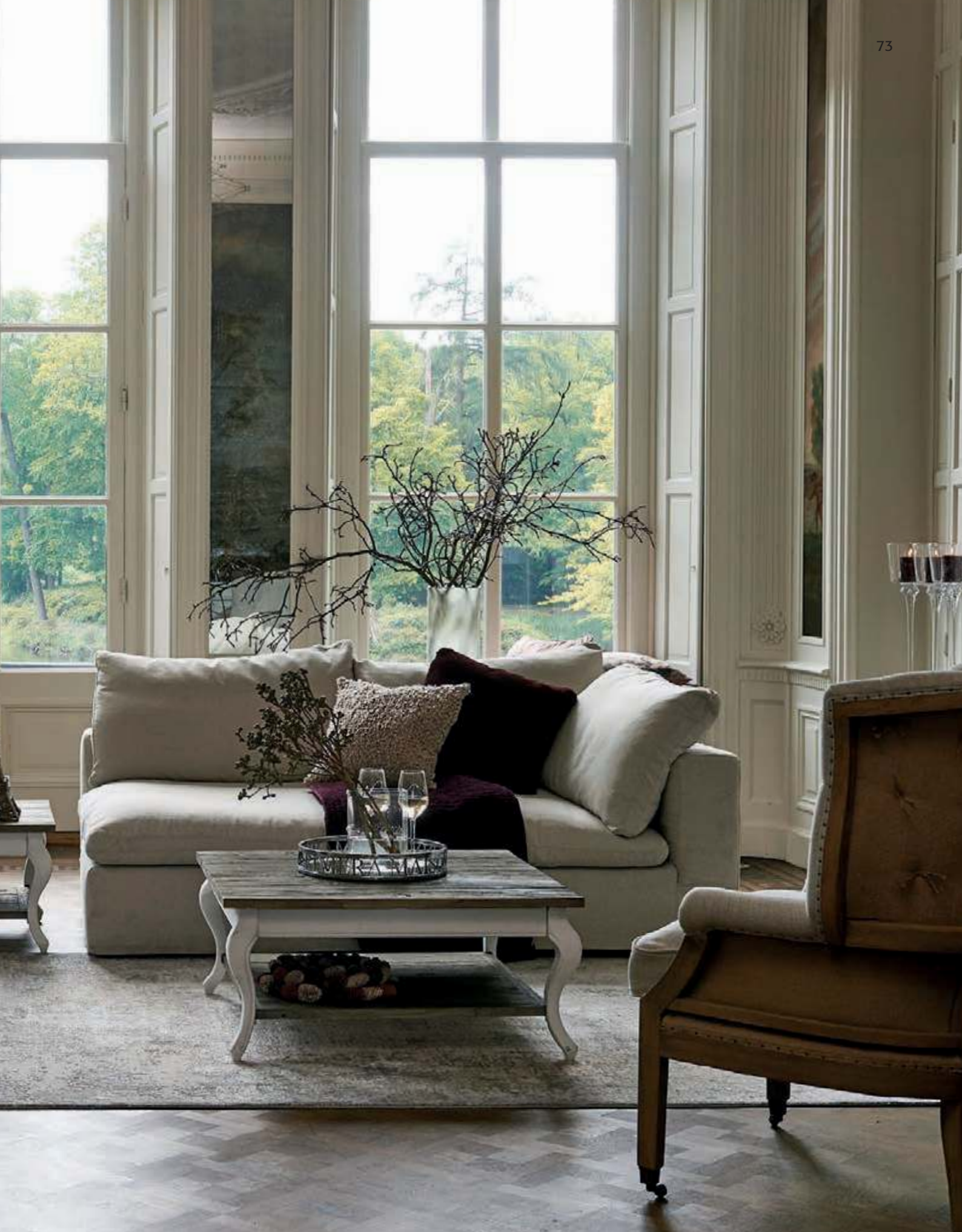
Lovely Bouclé Pillow Cover pink, 50 x 50 cm, Boutique Burgundy Faux Fur Pillow Cover 45 x 45 cm, Velvet Versaille Throw, Cunningham Wing Chair linen, fabulous flax. * Available from the end of September 2019.