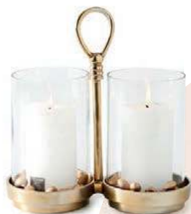
Lisbon 2 Glasses Hurricane**