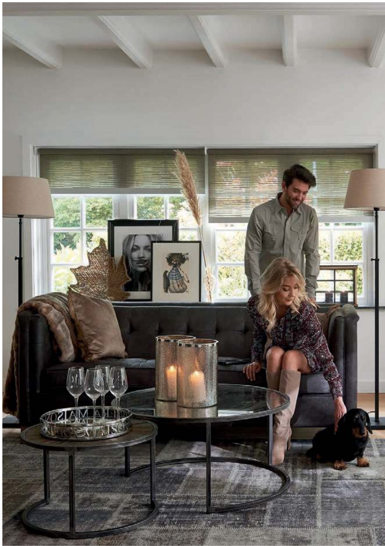
Cameron Coffee Table set of 2, Rivièra Maison Signature Serving Tray, Fancy Herringbone Hurricane large, Radziwill Sofa 3 Seater pellini, espresso, Satin Sable Faux Fur Pillow Cover 50 x 50 cm*, Satin Sable Faux Fur Throw*, Nisantasi Carpet grey, 300 x 200 cm, Rustic Rattan Maple Leaf Serving Tray, Wall Art Kate Moss 60 x 50 cm, Union Square Loft Lantern*, Classic Natural Linen Lampshade natural, 42 x 55 cm, Soho House Floor Lamp.

* Available from the end of September 2019.