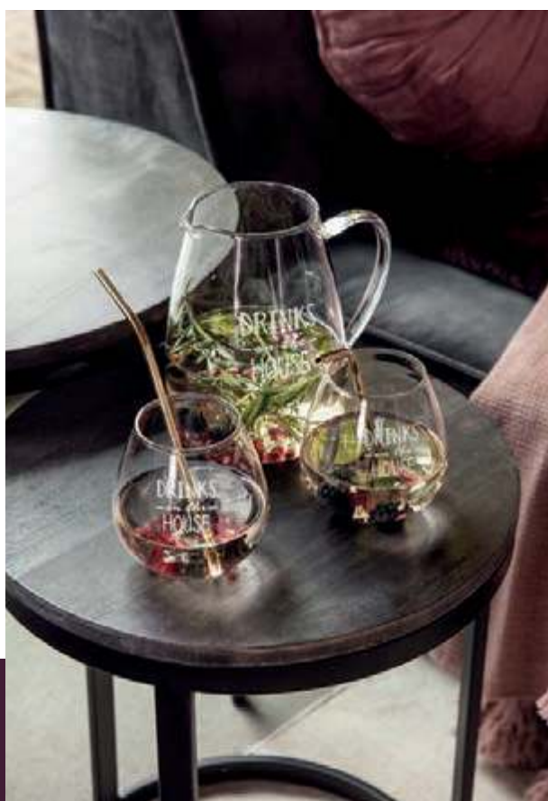
Boutique Burgundy Faux Fur Throw 150 x 130 cm, Pulitzer Sofa 3.5 Seater leather, charcoal, Costa Mesa Coffee Table 90 x 90 cm, Diplomat Coffee Table 60 x 60 cm, Concorde Champagne Cooler, Drinks On The House Jug, Drinks On The House Glass.