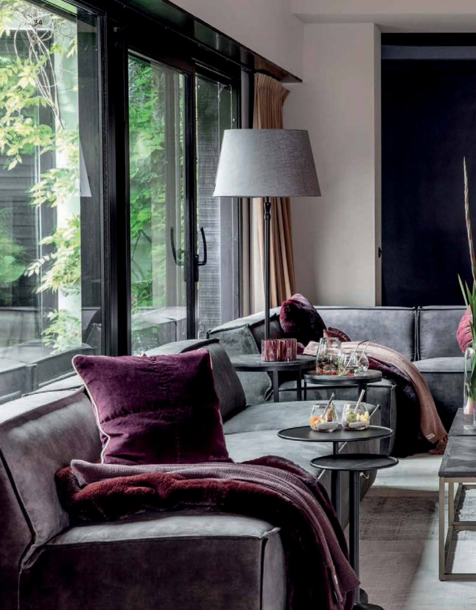
The Jagger Center velvet, grimaldi grey, The Jagger Corner velvet, grimaldi grey, The Jagger Corner Arm Right velvet, grimaldi grey, set as shown, Boutique Burgundy Faux Fur Throw, Urban Tassel Stone Washed Throw burgundy, Elegant Quilted Pillow Cover burgundy, 50 x 50 cm, Venice Adjustable Sofa Table black, medium and large, Bedford Avenue Side Table Lamp set of 2, Loveable Linen Lampshade charcoal, 35 x 45 cm, Costa Mesa Coffee Table 90 x 90 cm,