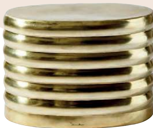
Times Square Pouf gold**