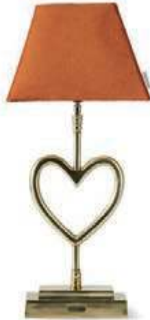
With Love Table Lamp soft gold, Velvet Square Lampshade pumpkin, 15 x 20 cm.