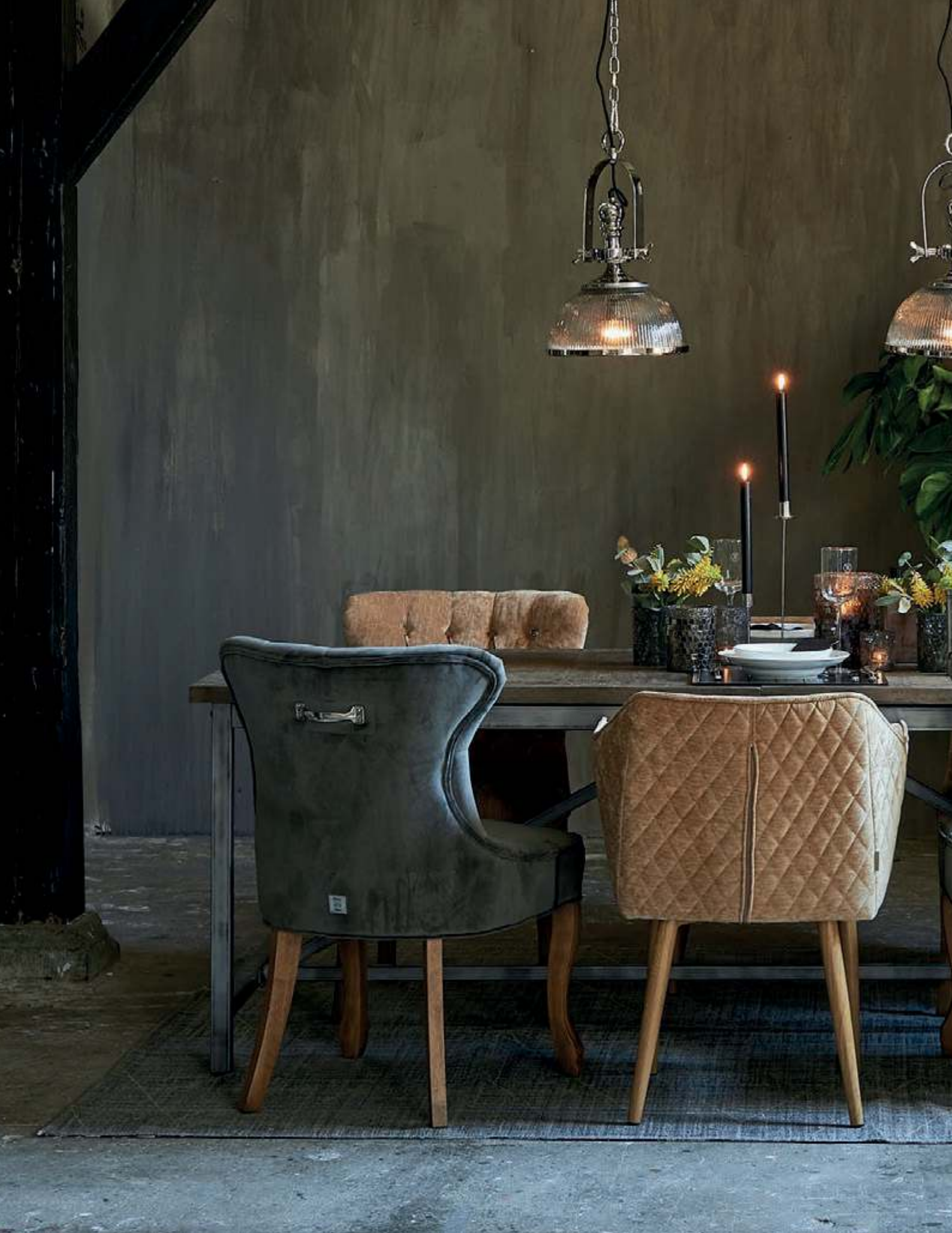
Brixton Factory Hanging Lamp, Arlington Dining Table 220 x 90 cm, Megan Dining Armchair velvet, copper, Wessex Dining Chair velvet, copper, George Dining Chair velvet, slate grey, Shoreditch Candle Holder medium and large, Sparkling Mosaic Hurricane small* and medium*, Magic Mosaic Votive small and medium,