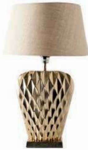
Berkeley Table Lamp, Loveable Linen Lampshade natural, 35 x 45 cm.