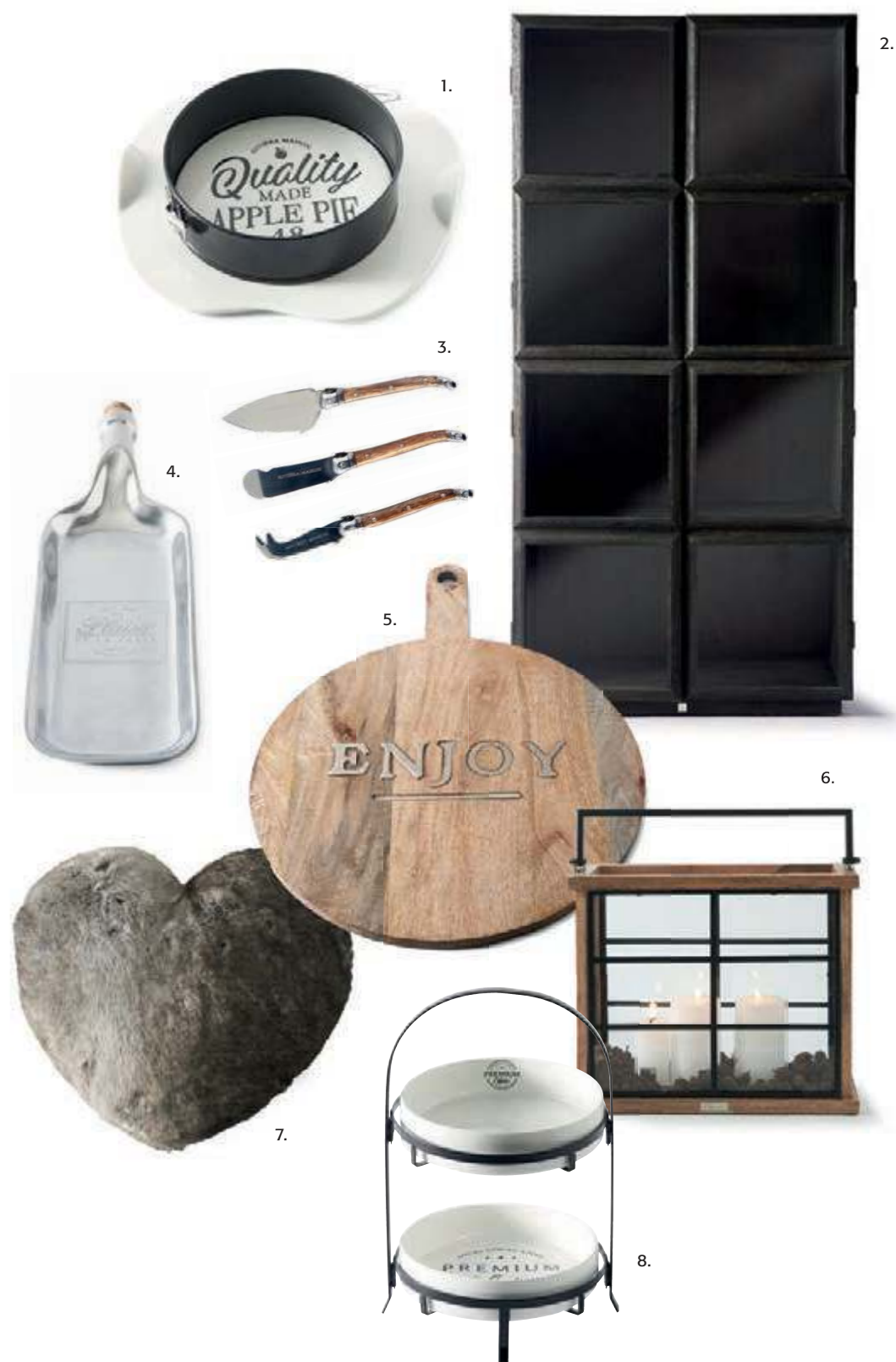
1. Quality Made Apple Pie Springform, 2. Belmont Buffet Cabinet, 3. Fine Dining Cheese Knives set of 3*, 4. Plaisir De La Table Serving Tray small, 5. Enjoy Chopping Board Round, 6. Union Square Loft Lantern*, 7. Chinchilla Faux FurHeart Pillow, 8. RM Premium Choice Etagère. * Available from the end of September 2019.