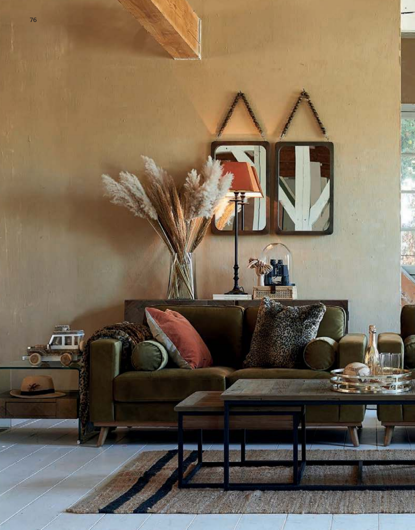
Soho Loft Coffee Table 60 x 60 cm, Rustic Rattan Desert Jeep, Notting Hill Sofa 2 Seater velvet, windsor green, Leopard Faux Fur Throw**, Vintage Velvet Pillow Cover pumpkin, 50 x 50 cm** and orange, 50 x 50 cm**, Leopard Faux Fur Pillow Cover 50 x 50 cm**, RM Beads Mirror 70 x 44 cm, L'Hotel Lamp Base black, large, Velvet Square Lampshade pumpkin, 21 x 31 cm, Shelter Island Coffee Table set of 3, Bondstreet Mirror Tray*, Grimaldi Hurricane medium,