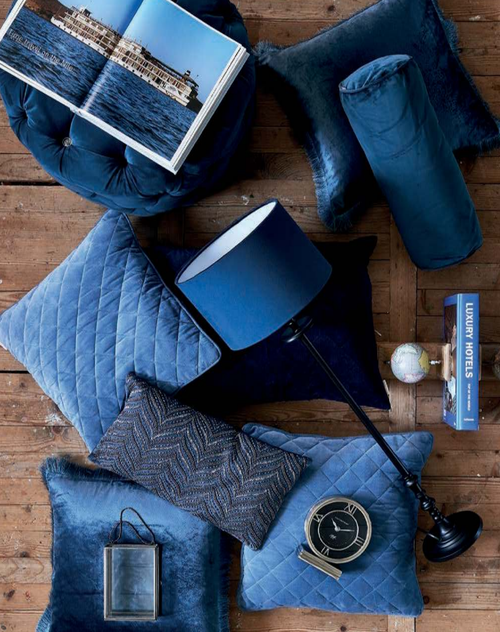
Opera Hocker velvet, ocean blue, Fabulous Fringe Pillow Cover midnight blue, 50 x 50 cm*, Velvet Roll Pillow ocean blue, 55 x 19 cm, Velvet Cylinder Lampshade dark blue, 15 x 20 cm, L'Hotel Lampbase black, large, Classic Globe Bookstand set of 2*, Basic Diamond Quilted Pillow Cover dark blue, 50 x 50 cm*, 65 x 45 cm, Precious Imperial Velvet Pillow Cover midnight blue, 50 x 30 cm, French Glass Hanging Photo Box medium, Contemporary Clock. * Available from the end of September 2019.